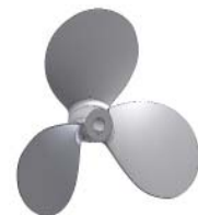
Plenty Forward Rake